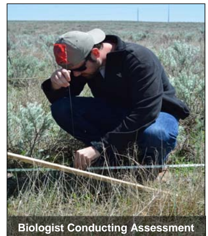
Biologist Conducting Assessment