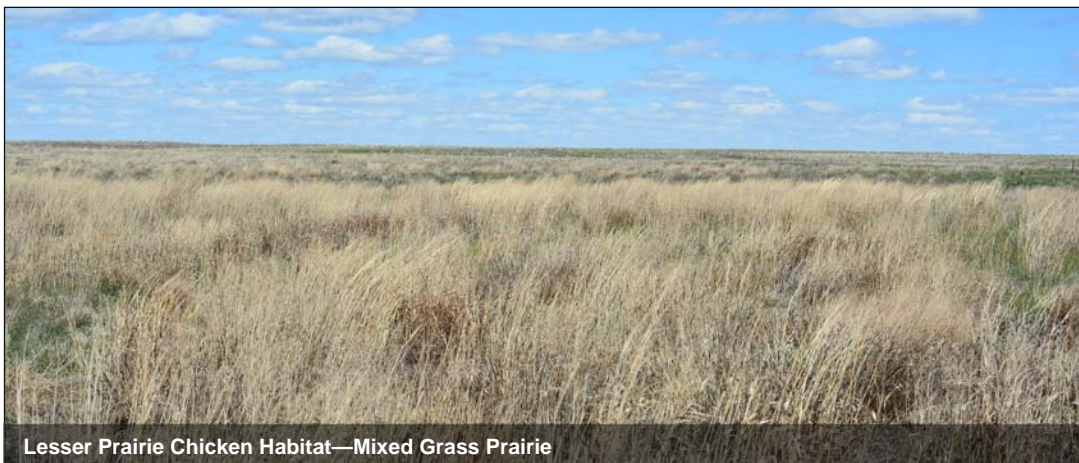
Lesser Prairie Chicken Habitat—Mixed Grass Prairie